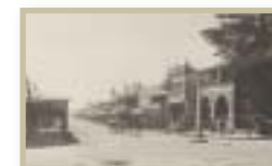
Junction Street Nowra